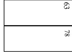
Boards 78 & 63

VICTORY CONDITIONS: The Russian Player wins at game end if there are no good order Hungarian units on or adjacent to a level 3 Hill location on board 78.