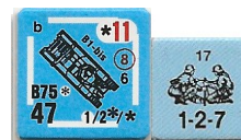
See SSR 10